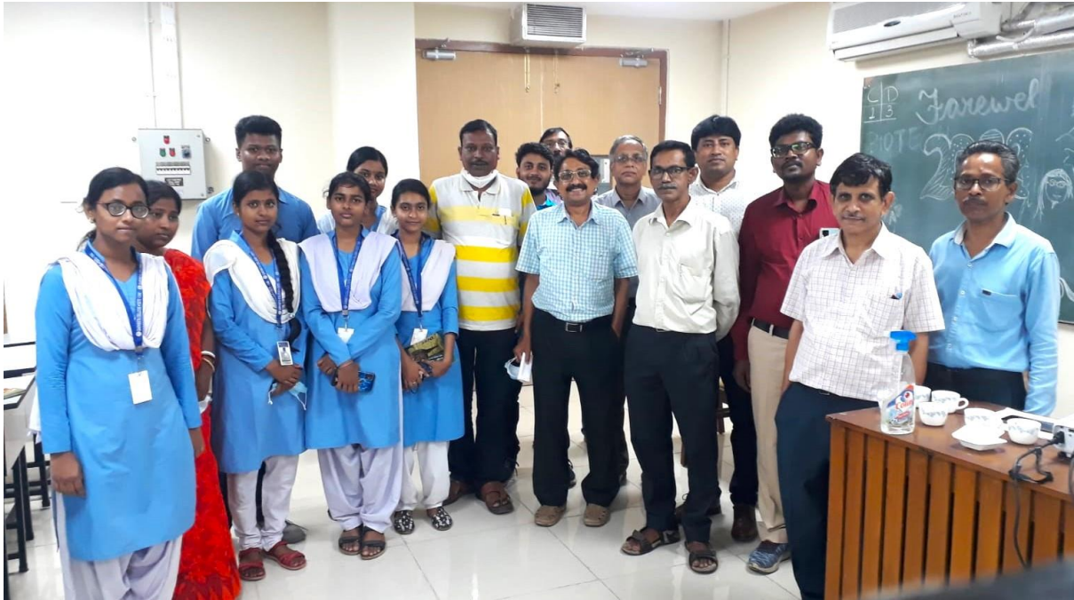
IIT-Kharagpur, Department of Biotechnology